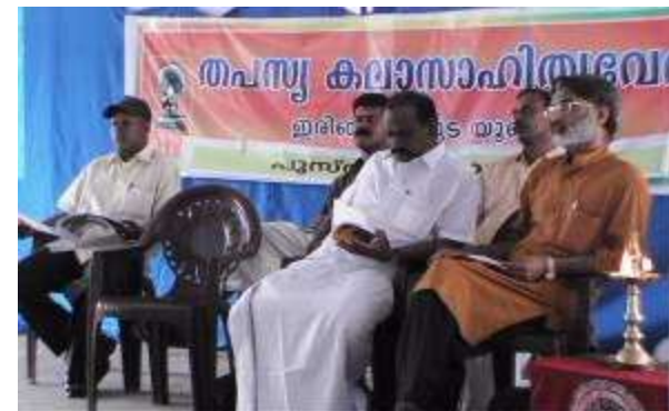
Thapasya organized LIFE made SIMPLE release at Irinjalakuda, Trichur on 23 rd November 2008 along with a Class on “Personality Development”