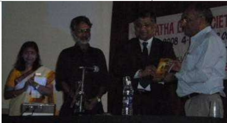
Hon. High Court Judge Thottathil B Radhakrishnan released LIFE made SIMPLE at Kochi on 26 th November 2008 along with a session on ‘Functional Proficiency’ organized by Adv. Rajendran Nair for SAMATHA LAW Society